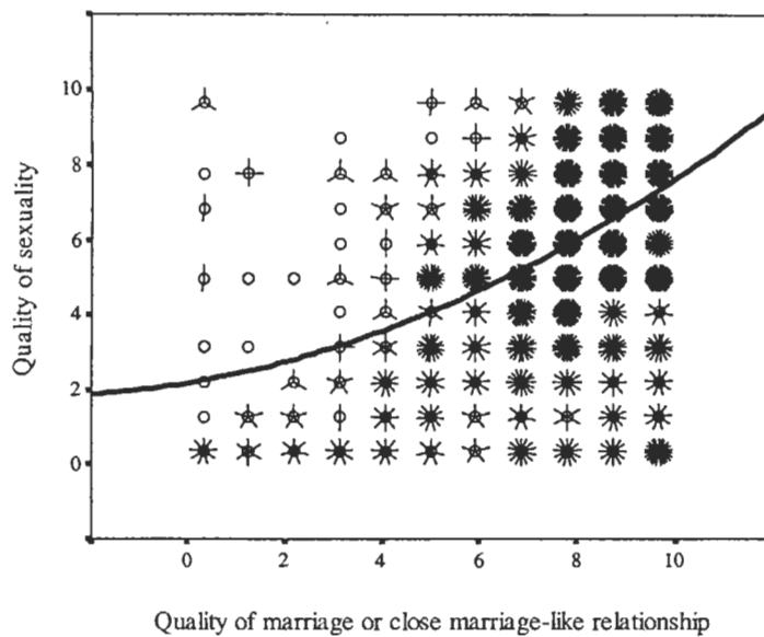
FIGURE 1. Relationship between quality of sexuality and quality of marriage. Because of the large number of individuals at each coordinate, each individual is represented by a circle or a spoke from the circle (thus, denser points represent more individuals). This figure shows first that quality of sexuality is highly related to quality of marriage. Second, it shows that below a marriage quality of about 4, sexuality quality is nearly uniformly poor; above 4, improvements in marriage quality are associated with increasingly larger improvements in quality of sexuality.

The pattern of correlations is consistent with the possibility that how things are going in some domains affects how things are going in other related domains. Although there isn't space in this chapter to examine each of the correlations, several stand out for particular attention. For example, the quality of work likely affects the quality of one's financial situation, and the correlation between the quality of the two domains is .41. Similarly, health likely facilitates productivity, thereby facilitating work situation quality, r = .30 . The largest correlation, that between marriage and sexual quality, is particularly interesting. These two domains likely facilitate each other, but the data show that this facilitation is not symmetrical. Figure 1 shows the scatter plot of responses to the two items, with each circle and each spoke representing one person. The scatter plot vividly depicts the strong relationship between the two responses, as well as its curvilinear nature. When marriage quality is lower than about 4, quality of sexuality is nearly uniformly low. When a minimal level of quality in marriage (around 4) is reached, slight increases in marriage quality are associated with large and increasingly larger improvements