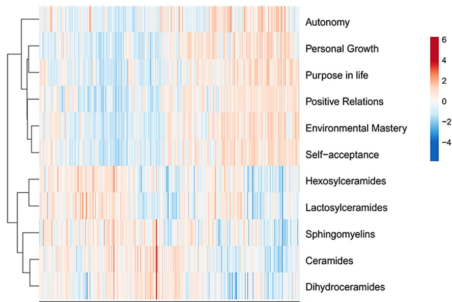
Figure 2. Hierarchical clustering heatmap of subjects from MIDUS, based on PWB dimensions and sphingolipid levels. Columns represent individual participants. Rows represent sphingolipid classes and PWB dimensions. A three-color scale was used with blue indicating low relative values, white indicating average values, and red representing high relative values. This heatmap was performed using the web tool ClustVis 2.0 ( https://biit.cs.ut.ee/clustvis ).