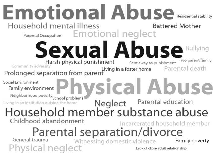
Fig. 1. Types of adverse childhood experiences included in studies. Note: The size of the word reflects its frequency of measurement in studies. The adversity type may have been measured as an individual item, included as part of a summary or score, or both. The shade of the word has no meaning.

study, the highest levels of hazardous drinking were reported by bisexual women with CSA histories compared to heterosexual and lesbian women with CSA histories (Hughes, Szalacha, et al., 2010).