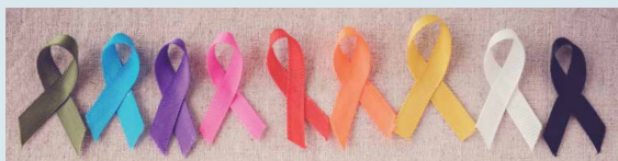
Cancer awareness ribbons, each representing a different type of cancer.