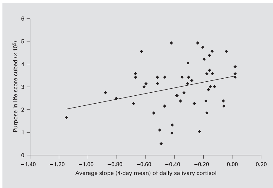
Fig. 2. Relationship between average slope of daily salivary cortisol and purpose in life (older women aged 75+, n = 52).

hypotheses. The columns of the table divide the correlations of well-being and biomarkers into those with significant positive association, no significant link, or significant negative associations. The rows of the table divide the correlations of ill-being and biomarkers in the same fashion. The four dark-shaded cells identify outcomes that support the ‘distinct’ hypothesis – i.e., instances in which a significant association for well-being (or, respectively ill-being) with a specific biomarker was accompanied by a nonsignificant finding for measures of