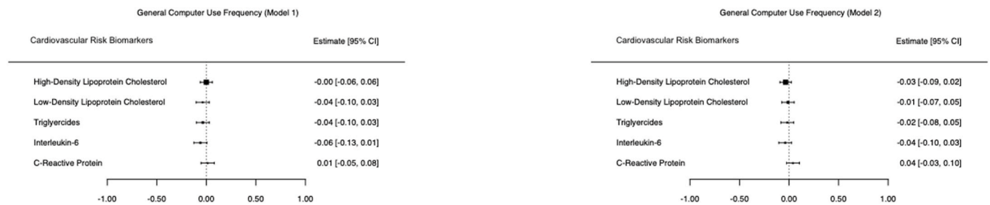
Fig. 1. Forest Plot of General Computer Use Frequency on Cardiovascular Risk Biomarkers

Note. Position of each square indicates the effect size contributed by the cardiovascular risk biomarker on general computer use frequency. Size of each square indicates sample size. Whiskers indicate 95% confidence intervals.